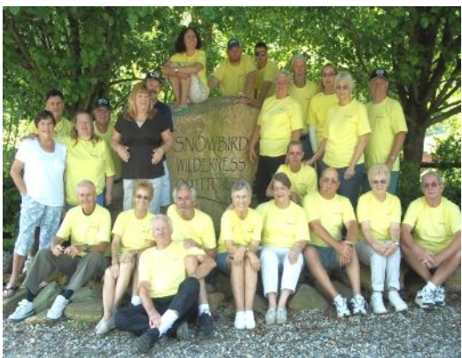
ADULT - 2010

Would you like to be part of the SWBC mission outreach? We are told by Christ to go to the end of the world. Too many Christians pass this command off to the cooperative church, but in reality we must accept this individually, because if we don't, it will never happen cooperatively. SWBC gives over 10% of our general offerings to the SBC Cooperative program, but that is not enough. We must become personally connected to missions. As of today SWBC has a couple missions outreaches and we hope to be adding more.