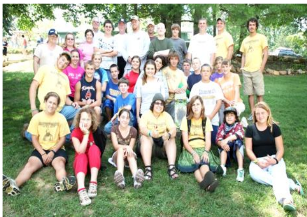
YOUTH - 2010

One is Snowbird where our youth go to summer camp. Our adults go as a mission in May every year to help them get ready for campers. In reality, we have become a very important part of this camp that has over 3000 plus students each year. I believe