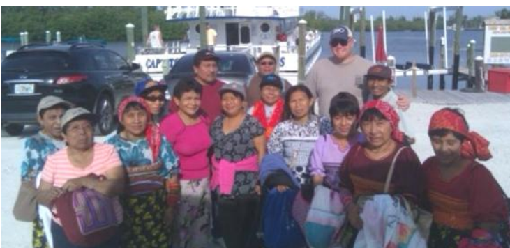
Visiting Kunas getting ready to go deep sea fishing on Cap't. Tony's boat.

On the fourth day we Baptized five of the new converts, four adults and one 12 or 13 year old boy. You can use the enclosed postage paid envelope to request a DVD of our August trip.